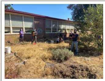
Last year's Community Care crew!